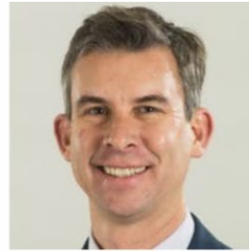
BOOK HOOK, III